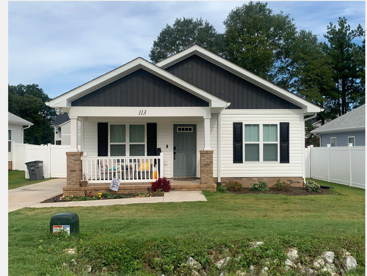
Habitat for Humanity: Sturtevant Street Project 5 homeownership units