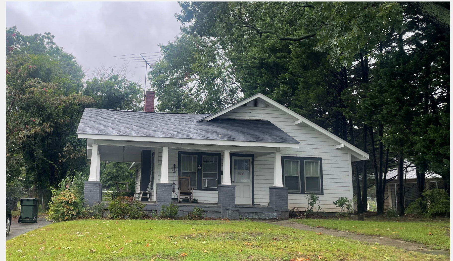
Home Repair: For seniors up to 80% AMI 32 units completed