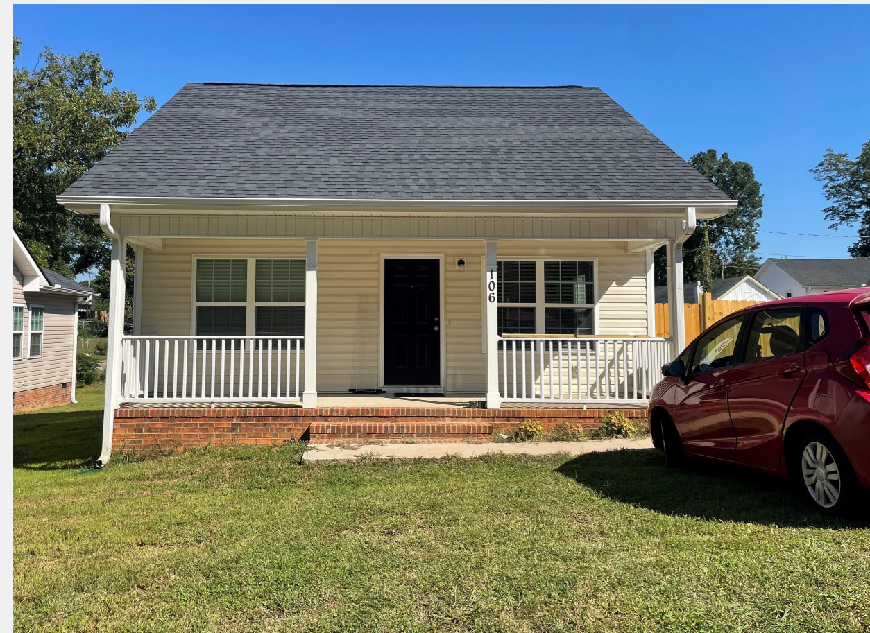
Nehemiah: Homeownership up to 80% AMI