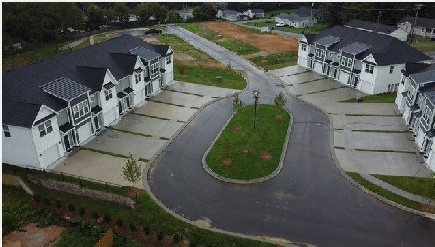
Fairview Townhomes: 14 homeownership units up to 80% AMI