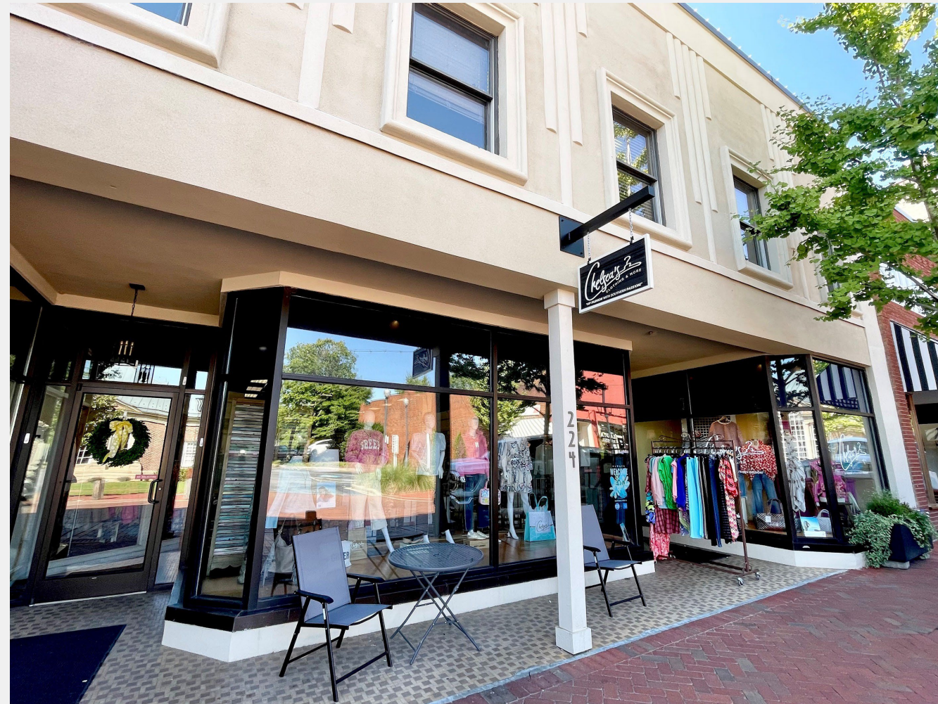
Chelsea's Ladies Apparel Greer