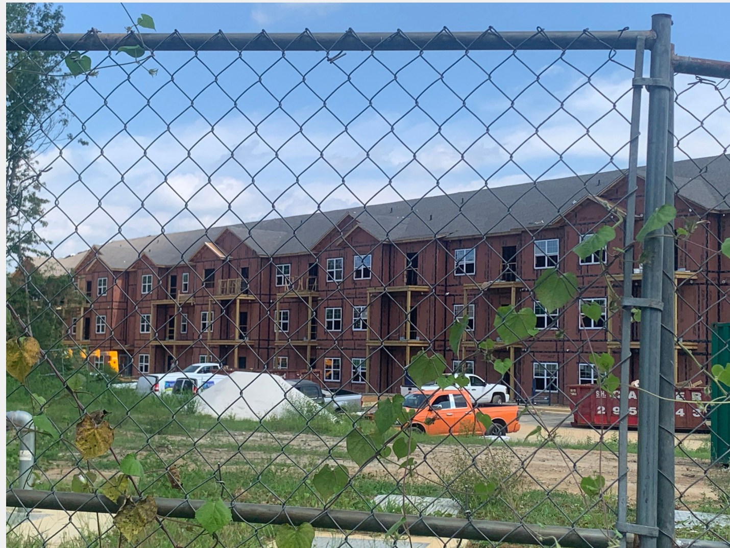
Southpoint Senior Apartments, 90 affordable rental units: GCAHF