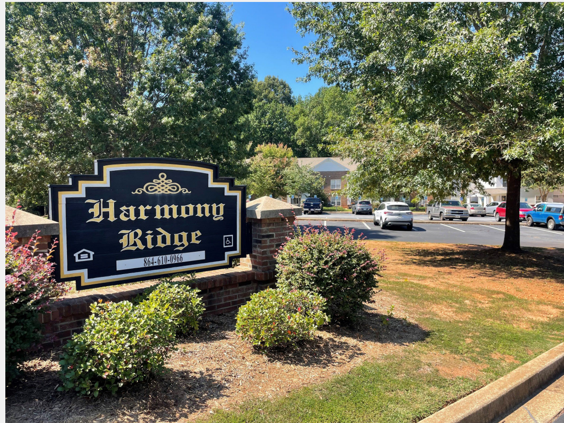
Harmony Ridge: Senior Affordable Housing