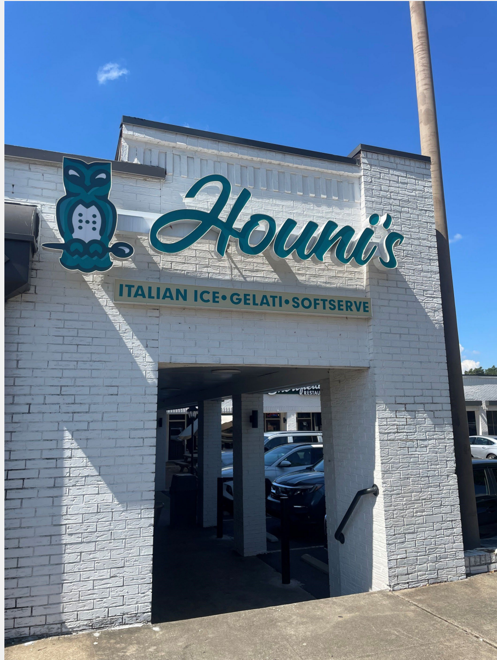
Houni's Italian Ice Simpsonville