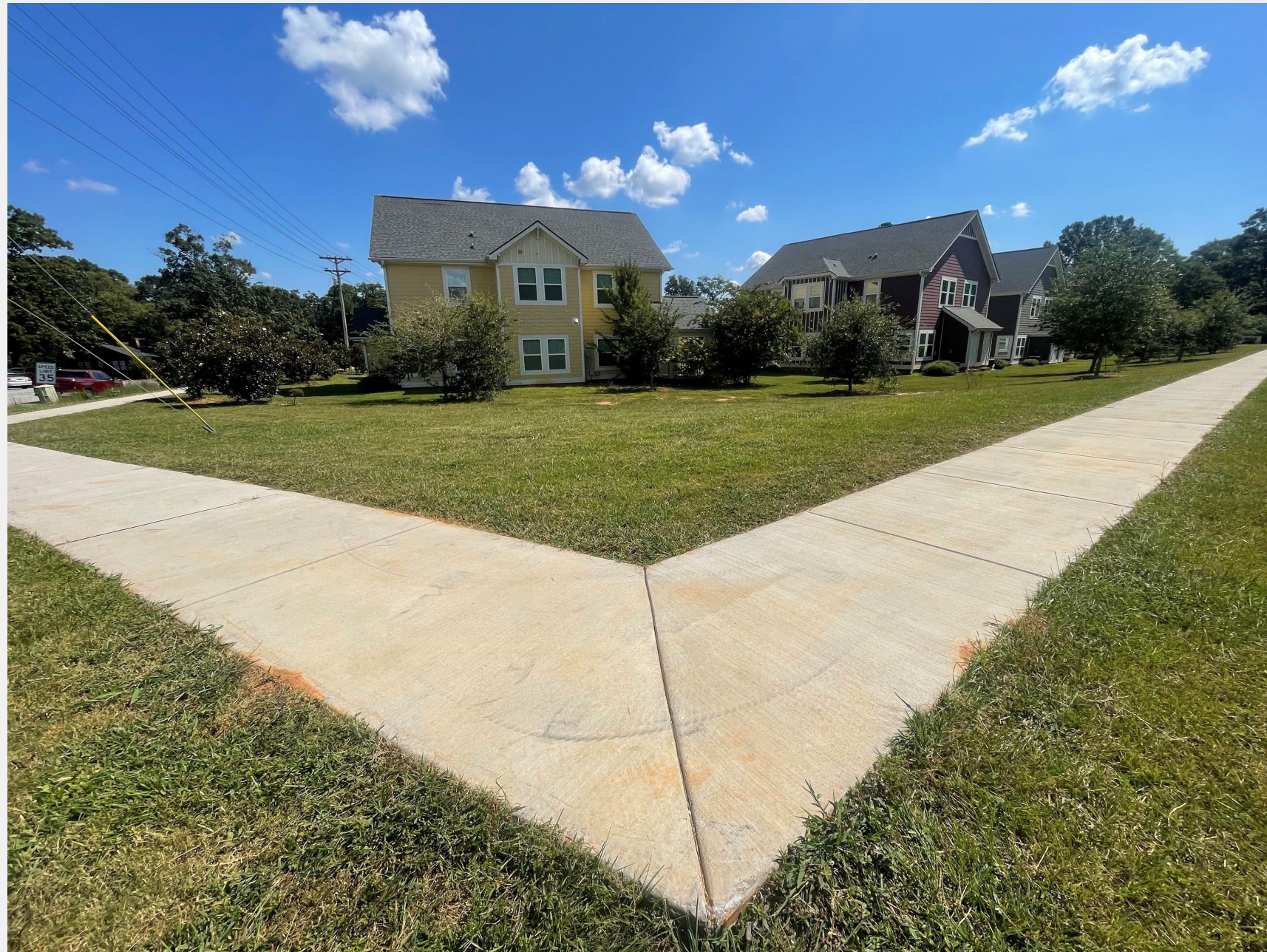
Miller Place Sidewalks