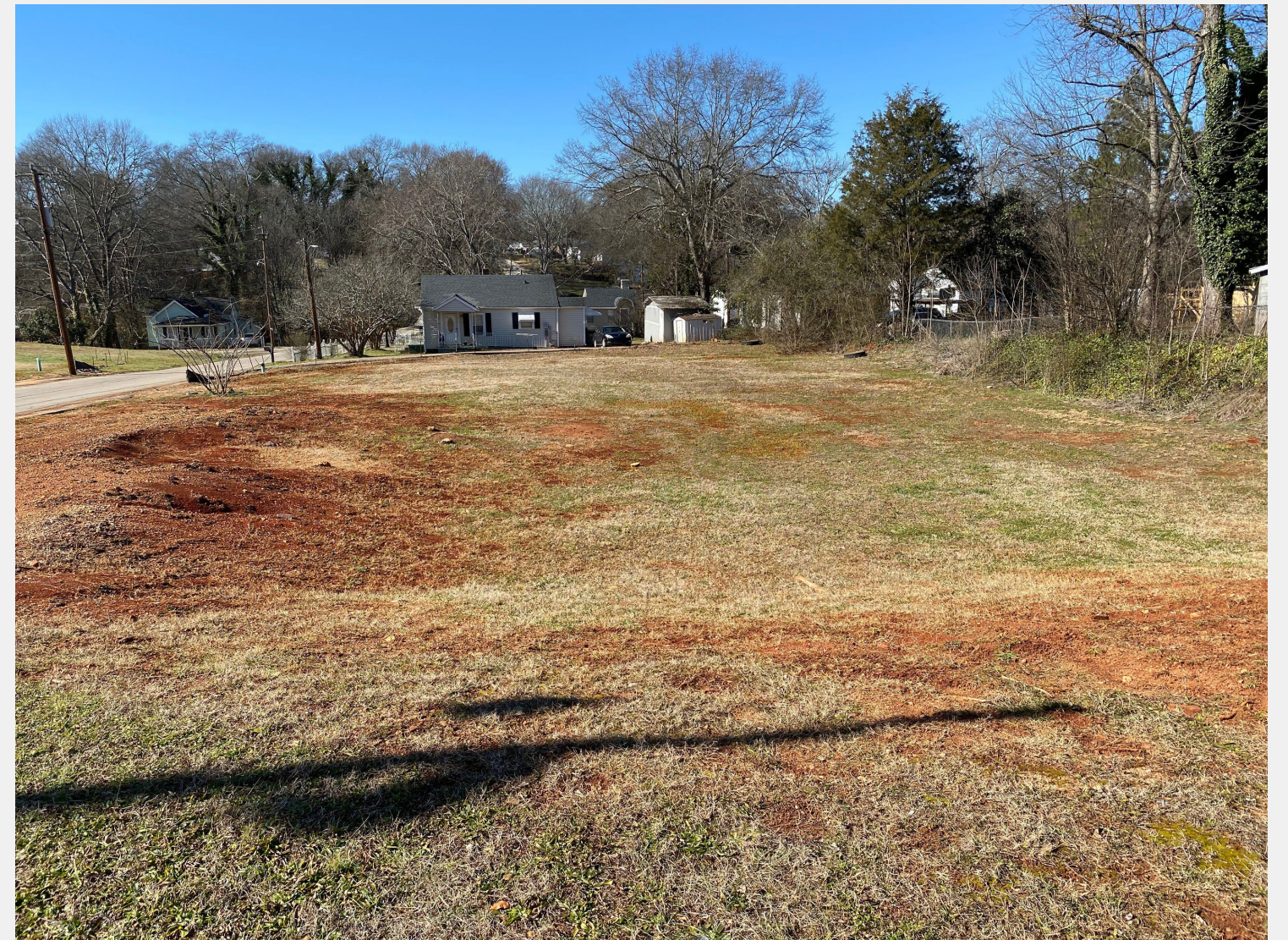
Gridley Place 11 units; homeownership and rental units: HOME & CDBG