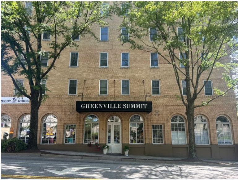
Greenville Summit Building