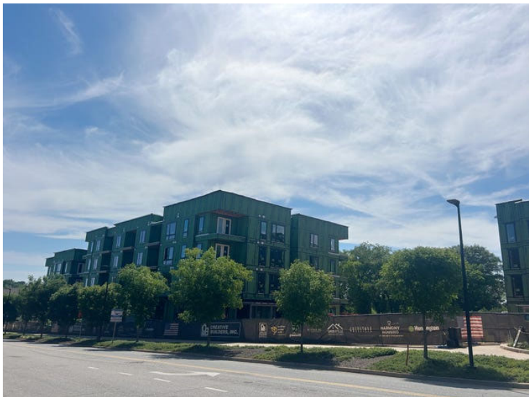
Southernside East, a 93-unit affordable housing complex for seniors, is currently being built near Unity Park.

This city money will be allocated to partner organizations, develop a master plan for Unity Park-area affordable housing, and allow the city flexibility to respond to opportunity as it arises during the next fiscal year, according to the city. The fiscal year begins July 1.